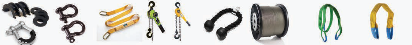
Cross D-Shackles Crosby boomers & lifting slings Cable ropes Lifting slings Belt Ratchets