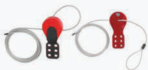
Lock out & Tag out