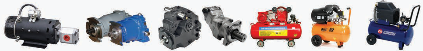
Hydraulic pumps & motors Electric Compressor Engine driven Compressor Portable mini Compressor