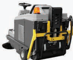
Isal industrial sweepers