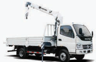
Truck mounted cranes