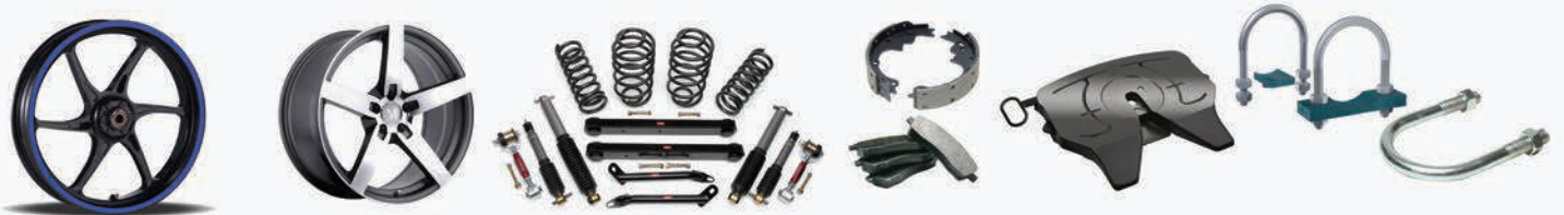
Wheel rims, Suspension assy & parts, Landing legs, Fifth wheel assy, Oilseals, UJ Cross, Centre bearings, Leaf spring assy, U-bolts, Brake shoes & Linings, Torque rods & Bushings