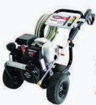
Pulitecno pressure washers