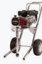
Grasco airless paint spray machines High pressure washers & line marker machines