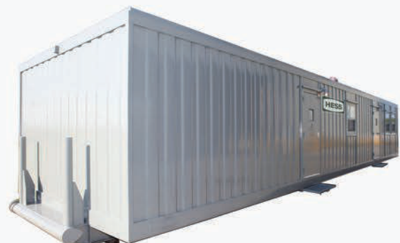
Container fabricated offices & work stations