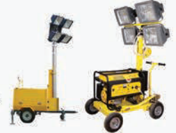
Lighting Tower sets