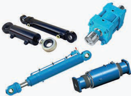
Hydraulic cylinders, valves, solenoids