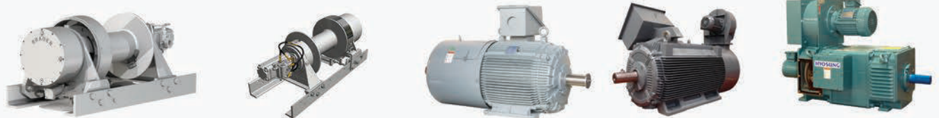
Braden winches & Hoists Industrial electric motors