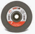
Cutting discs & Grinding discs