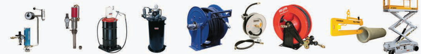
Air operated oil Pumps Grease Pumps Fuel transfer Pumps Hose reels for lube Fillrite fuel dispensing Pumps Lifting equipments