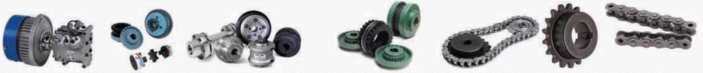
Coupling drives for different applications Sureflex couplings, duraflex couplings Roller chains & coupling drives