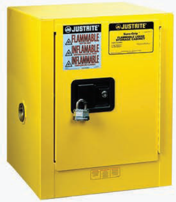
Justrite flammable Cabinets