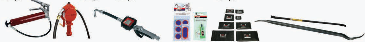
Grease Pumps Rotary pump Digital lube dispenser Rema tiptop tyre service kits Truck tyre levers