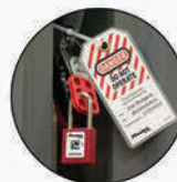
Complete Tag Out/Lock out for Hydraulics & Electricals