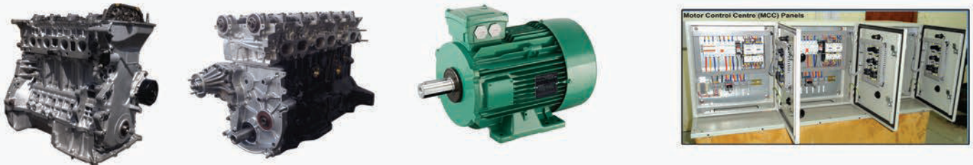
Rebuild engines, Transmissions, S/motors & Alternators, Electrical motor,