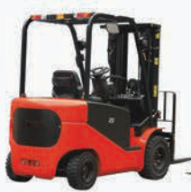
Diesel & Electric forklift trucks