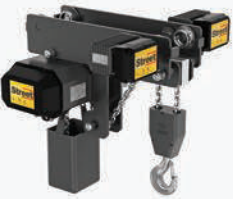
Overhead Electric chain blocks