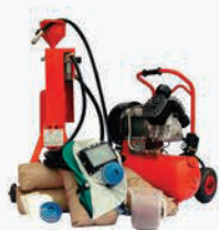
Sand blasting unit & accessories, Internal pipe blasting & cleaning blasting nozzles