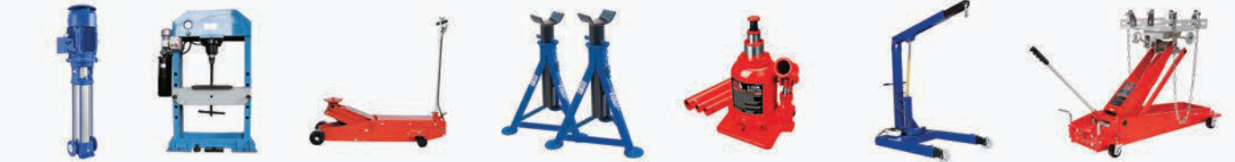
Multistage Hydraulic Trolley jack Axle stands Bottle jacks Engine crane Transmission jack