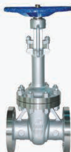
Industrial gate valves, Ball valves, PVC valves