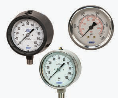
Wika pressure gauges