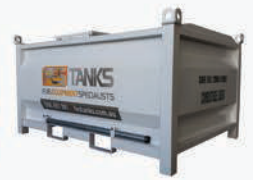
Bulk Fuel Tank