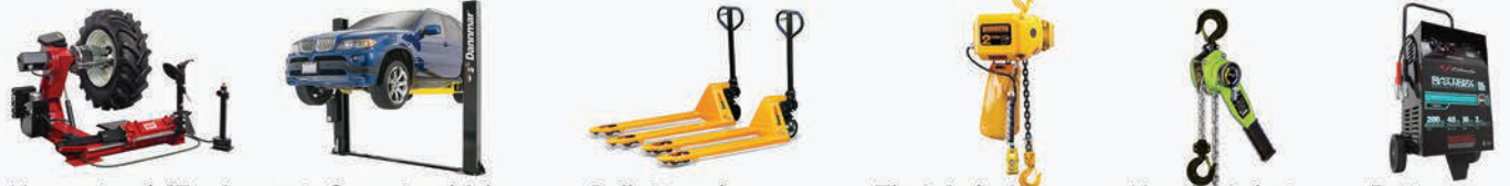
Heavy truck/Equipment tyre changers 2 post vehicle lifts Pallet trucks Electric hoist Hand ratchet hoists Battery charger