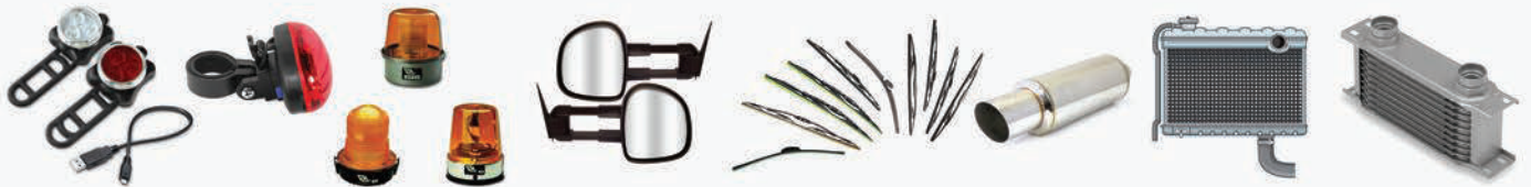
Lights & Accessories Lamps Side Mirrors Wipers Exhaust Mufflers Radiators Oil Coolers