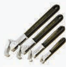
Adjustable Spanner Sets