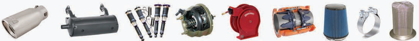
Nelson exhaust pipes, Airbag suspensions, Brake booster, Brake valves, Brake air hoses, Air filters, Palm couplings, Spark arrestor