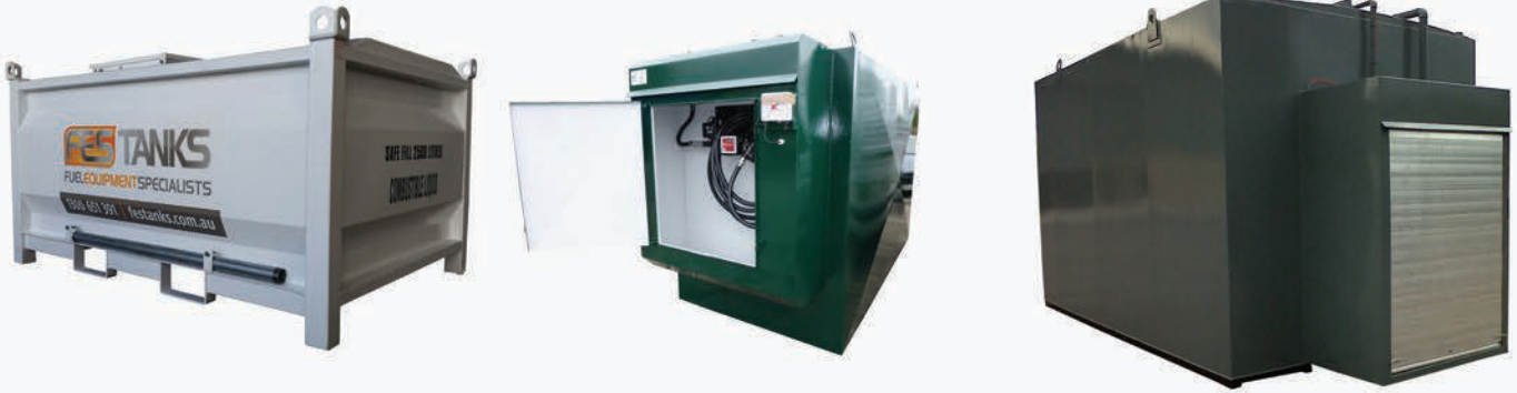
Fabrication of self bunded cube tanks