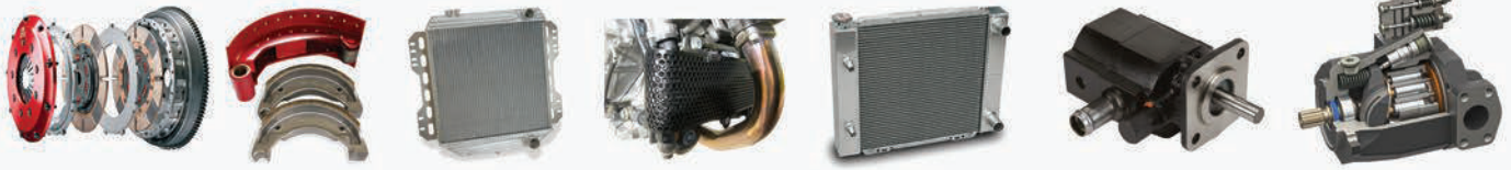
Relining clutch discs, Relining brake shoes, Radiator servicing, Oil cooler servicing, Hydraulic pump & Cylinder repair