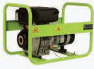
Portable diesel generators