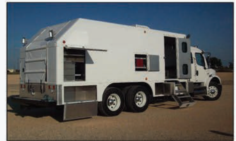
Customized Operators cabin for oilfield trucks