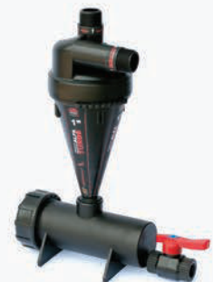
Air separator for sand (Asphalt & concrete plant)