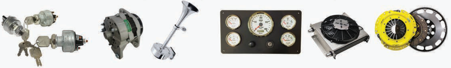
Polack electrical switches, Delco alternators & starter motors, Electrical horns, Instrumental panels, Engine fans, Clutch parts

Spare parts for American trucks (Kenworth, Mack, Western star, International, Peterbilt, Freightliner) & European trucks (MAN, Mercedes, Volvo, Scania)