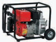
Robin dewatering pumps